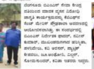
ಬೋಲಿಂಗ್ ಸಬ್-ಇನ್‌ಸ್ಟಿಟ್ಯೂಟ್‌ನಲ್ಲಿ ತೊಂಡು ನೆಲೆಗೊಳಿಸುವ ಯೋಜನೆಗೆ ಬಿಜೆಪಿ ಸರ್ಕಾರವು ಮುನ್ನೆಲೆಯಲ್ಲಿ ನಿಲ್ಲುತ್ತಿದೆ.

ಬೋಲಿಂಗ್ ಸಬ್-ಇನ್‌ಸ್ಟಿಟ್ಯೂಟ್‌ನಲ್ಲಿ ತೊಂಡು ನೆಲೆಗೊಳಿಸುವ ಯೋಜನೆಗೆ ಬಿಜೆಪಿ ಸರ್ಕಾರವು ಮುನ್ನೆಲೆಯಲ್ಲಿ ನಿಲ್ಲುತ್ತಿದೆ. ಈ ಯೋಜನೆಯಡಿ ತೊಂಡು ನೆಲೆಗೊಳಿಸುವ ಯೋಜನೆಗೆ ಬಿಜೆಪಿ ಸರ್ಕಾರವು ಮುನ್ನೆಲೆಯಲ್ಲಿ ನಿಲ್ಲುತ್ತಿದೆ. ಈ ಯೋಜನೆಯಡಿ ತೊಂಡು ನೆಲೆಗೊಳಿಸುವ ಯೋಜನೆಗೆ ಬಿಜೆಪಿ ಸರ್ಕಾರವು ಮುನ್ನೆಲೆಯಲ್ಲಿ ನಿಲ್ಲುತ್ತಿದೆ.