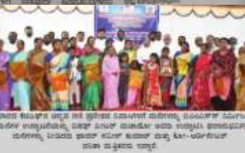
ಹಕ್ಕುಗಳ ಬಳಸಿಕೊಂಡು ಸ್ವಾಭಿಮಾನಿಗಳಾಗಿ: ಎಸ್ಸಿ. ಈ ಸಂದರ್ಭದಲ್ಲಿ ಹಕ್ಕುಗಳ ಬಳಸಿಕೊಂಡು ಸ್ವಾಭಿಮಾನಿಗಳಾಗಿ: ಎಸ್ಸಿ.

ಹಕ್ಕುಗಳ ಬಳಸಿಕೊಂಡು ಸ್ವಾಭಿಮಾನಿಗಳಾಗಿ: ಎಸ್ಸಿ. ಈ ಸಂದರ್ಭದಲ್ಲಿ ಹಕ್ಕುಗಳ ಬಳಸಿಕೊಂಡು ಸ್ವಾಭಿಮಾನಿಗಳಾಗಿ: ಎಸ್ಸಿ. ಈ ಸಂದರ್ಭದಲ್ಲಿ ಹಕ್ಕುಗಳ ಬಳಸಿಕೊಂಡು ಸ್ವಾಭಿಮಾನಿಗಳಾಗಿ: ಎಸ್ಸಿ. ಈ ಸಂದರ್ಭದಲ್ಲಿ ಹಕ್ಕುಗಳ ಬಳಸಿಕೊಂಡು ಸ್ವಾಭಿಮಾನಿಗಳಾಗಿ: ಎಸ್ಸಿ.