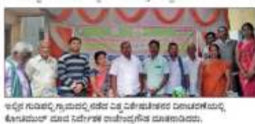
ಆರೋಗ್ಯದ ಕಡೆ ಗಮನ ನೀಡಲು ಬಿಜೆಪಿ ಸರ್ಕಾರವು ಕಾರ್ಯಕ್ರಮವನ್ನು ಆಯೋಜಿಸಿದೆ.

ಶಿವಮೊಗ್ಗ ಜಿಲ್ಲೆಯಲ್ಲಿ ಆರೋಗ್ಯದ ಕಡೆ ಗಮನ ನೀಡಲು ಬಿಜೆಪಿ ಸರ್ಕಾರವು ಕಾರ್ಯಕ್ರಮವನ್ನು ಆಯೋಜಿಸಿದೆ. ಈ ಸಂದರ್ಭದಲ್ಲಿ ಜಿಲ್ಲಾ ಆರೋಗ್ಯ ಮತ್ತು ಕುಟುಂಬ ಕಲ್ಯಾಣ ಇಲಾಖೆಯ ಅಧಿಕಾರಿಗಳು ಭಾಗವಹಿಸಿ ಮಾತನಾಡಿದರು. ಈ ಸಂದರ್ಭದಲ್ಲಿ ಜಿಲ್ಲಾ ಆರೋಗ್ಯ ಮತ್ತು ಕುಟುಂಬ ಕಲ್ಯಾಣ ಇಲಾಖೆಯ ಅಧಿಕಾರಿಗಳು ಭಾಗವಹಿಸಿ ಮಾತನಾಡಿದರು.