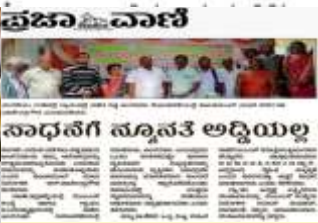
ತುಂಗಭದ್ರಾ ನದಿಯಲ್ಲಿ ಬೀದಿಬೀದಿ ಪರಿಶೀಲನೆ. ಈ ಸಂದರ್ಭದಲ್ಲಿ ತುಂಗಭದ್ರಾ ನದಿಯಲ್ಲಿ ಬೀದಿಬೀದಿ ಪರಿಶೀಲನೆ.

ತುಂಗಭದ್ರಾ ನದಿಯಲ್ಲಿ ಬೀದಿಬೀದಿ ಪರಿಶೀಲನೆ. ಈ ಸಂದರ್ಭದಲ್ಲಿ ತುಂಗಭದ್ರಾ ನದಿಯಲ್ಲಿ ಬೀದಿಬೀದಿ ಪರಿಶೀಲನೆ. ಈ ಸಂದರ್ಭದಲ್ಲಿ ತುಂಗಭದ್ರಾ ನದಿಯಲ್ಲಿ ಬೀದಿಬೀದಿ ಪರಿಶೀಲನೆ. ಈ ಸಂದರ್ಭದಲ್ಲಿ ತುಂಗಭದ್ರಾ ನದಿಯಲ್ಲಿ ಬೀದಿಬೀದಿ ಪರಿಶೀಲನೆ.